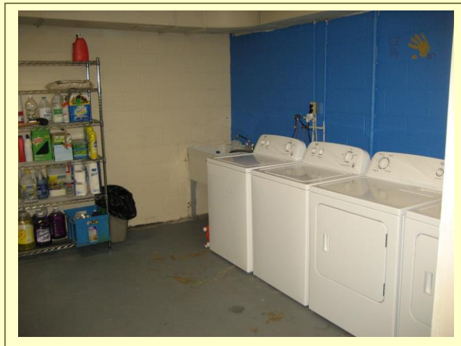
Upgraded laundry room

For many years the coin op laundry equipment at the house had been owned and operated by a 3rd party. These machines had recently started to have functional issues and the company that owned them was not providing adequate service. This spring, the academic chapter and the House Corporation decided to split the cost of purchasing our own sets of basic, reliable washers and driers (with extended warranty plans). We also had a new laundry sink installed. Additionally, the academic chapter cleaned and organized the laundry room and repainted the walls. The laundry room looks the best that I have ever seen it (at least in the last 12 years)!