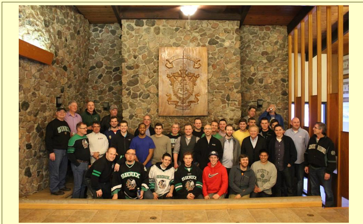
Alumni and academic chapter members at Hockey Weekend

Although this event was smaller than last years, it was successful...all those who took part had an enjoyable time and over $16,000 in donations was pledged. It was great to see the bathrooms repaired...it was fun to meet and visit with alumni brothers from different decades, and it was great to learn about the resurgence of our chapter on the UND campus. There are some fine young men in the brotherhood now and they are being led by some outstanding officers. As alumni, I hope that we will support the House Corporation so we can assist them and continue to make needed repairs and improvements to the house itself.