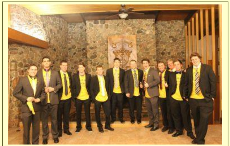
Fall 2013 Academic All-Stars