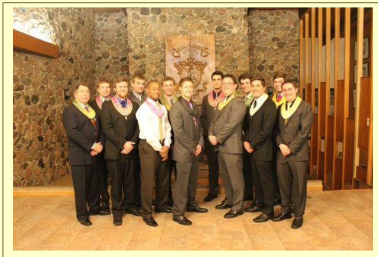
High Pi and new academic chapter officers

The exalted stations to which these men have been raised by the chapter's will and choice involve great responsibilities, and the manner in which they carry out the duties entrusted to them will determine whether this chapter will flourish or fade into insignificance.