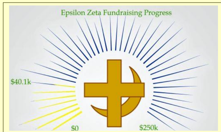
Fundraising status graphic

Epsilon-Zeta is presently in need of financial assistance from our gracious alumni to keep the dream alive at 515 Harvard St. Specifically, at present we are raising funds for: on-going maintenance and bringing chapter house up to date after many years of use and deterioration, paying down outstanding debts (late '90's flood repairs – furnaces, recent bathroom remodeling) and scholarships. The Alumni Association has set a goal of raising $250k by the end of 2014 to propel our chapter to new heights in the coming years and ensure our long-term success. 2013 and 2014 YTD fundraising is at ~$40.1k as of this writing. Find out how to donate here: www.ndlxa.org/documents/donate.html . Thank you so much to our gracious alumni who have donated thus far!!! We can't thank you enough. Here are the donation recognition levels 2013 and 2014 YTD: